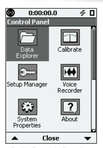
Familiar Controls for Ease-of-use

SoundTrack LxT® Shown with 1/3 Octave Frequency Analysis