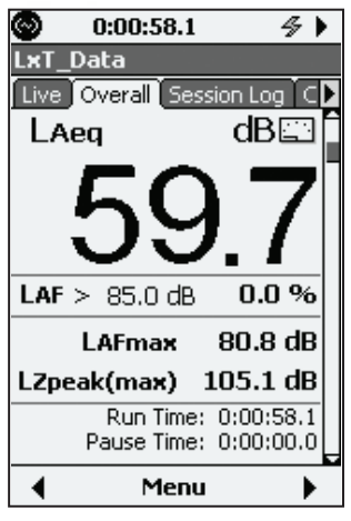
Large Numeric Display